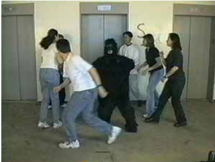
Figure 3. A single frame from an additional experimental condition in which the gorilla stopped in the middle of the display, turned to face the camera, thumped its chest, and then continued walking across the field of view. Subjects performed the Easy monitoring task while attending to the White team, and the noticing rate was similar to that in the corresponding condition with the standard (shorter) Opaque/Gorilla event.

Twelve new observers (6) watched this video while attending to the White team and engaging in the Easy monitoring task; only 50% noticed the event. This is roughly the same as the percentage that noticed the normal Opaque/Gorilla-walking event (42%) under the same task conditions.