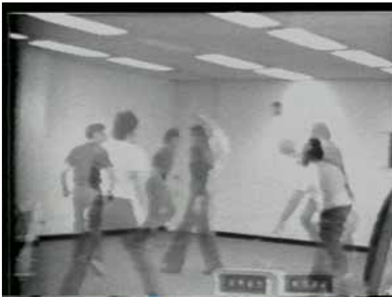
Figure 1. A single frame captured from a late-generation video of the umbrella-woman sequence used by Neisser and colleagues (eg Neisser 1979). The woman is in the center of the image and her umbrella is white.

In subsequent studies of selective looking, Neisser and his colleagues used this 'basketball-game' task [see Neisser (1979) for a description of several different versions]. In the most famous demonstration, observers attend to one team of players, pressing a key whenever one of them makes a pass, while ignoring the actions of the other team. After about 30 s, a woman carrying an open umbrella walks across the screen (this video was also superimposed on the others so all three events were partially transparent; see figure 1). She is visible for approximately 4 s before walking off the far end of the screen. The games then continue for another 25 s before the tape is stopped. Of twenty-eight naive observers, only six reported the presence of the umbrella woman, even when questioned directly after the task (Neisser and Dube, cited in Neisser 1979). Interestingly, when subjects had practice performing the task on two similar trials before the trial with the unexpected umbrella woman, 48% noticed her. When subjects just watched the screen and did not perform any task, they always noticed the umbrella woman, a result consistent with the inattention-blindness findings reviewed earlier (and with work on saccade-contingent changes; see Grimes 1996; McConkie and Zola 1979).